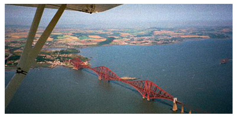
AM Stunning scenery as I remember?

No, weather routed us down the west coast, giving us a great view of the Forth Bridges on departure we headed for Carlisle and a wonderful leg over the Lake District and down to Caernarfon.